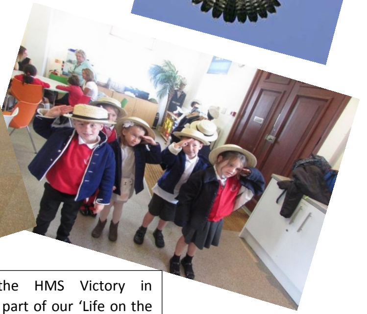
We visited the HMS Victory in Portsmouth as part of our 'Life on the Ocean Waves' topic.